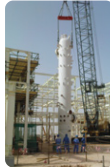
Erection Of Equipment At Harwel Project - Galfar Oman