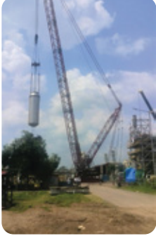
Ammonia Converter Basket Erection -CFCL Kota