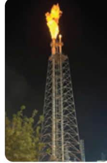
H.C Flare Tip Replacement - CFCL Kota

CHAMBAL FERTILISERS AND CHEMICALS LIMITED