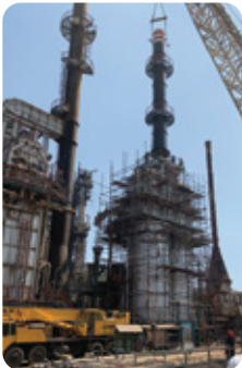
NMP Furnace Revamp -HPCL Mumbai Refinery